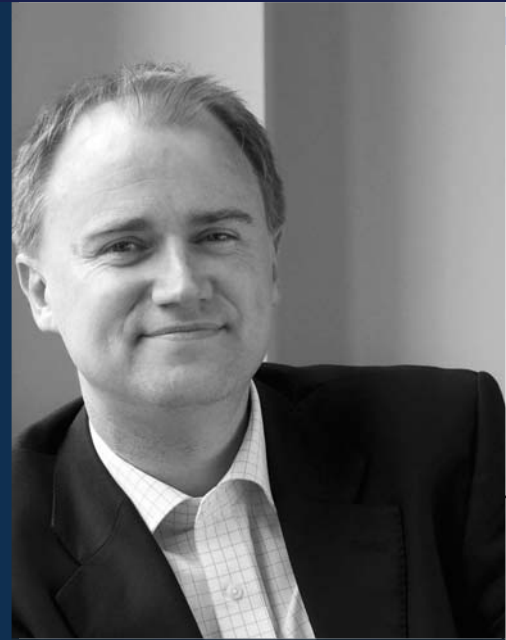
forward provides a quarterly platform to a prominent figure from the regions Healthcare Technologies sector

The success of the Healthcare Technologies sector is vital to the region's future economic prosperity and Yorkshire Forward will play its part in ensuring that the sector continues to receive the support it requires to innovate and enhance our global reputation.